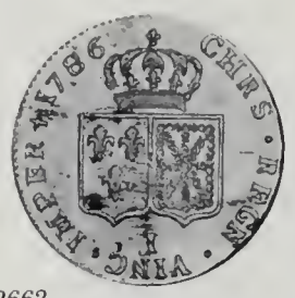
Lot No. 2662